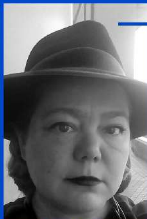
Lisa Movius The Art Newspaper