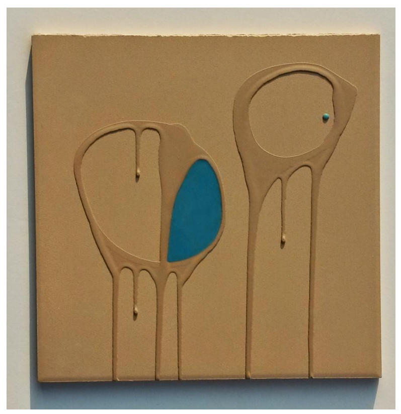
Nature Will Take Its Course 2 - Serial 1, 2015, 30x30x1 cm, Press Tile, Slip Application, Underglaze