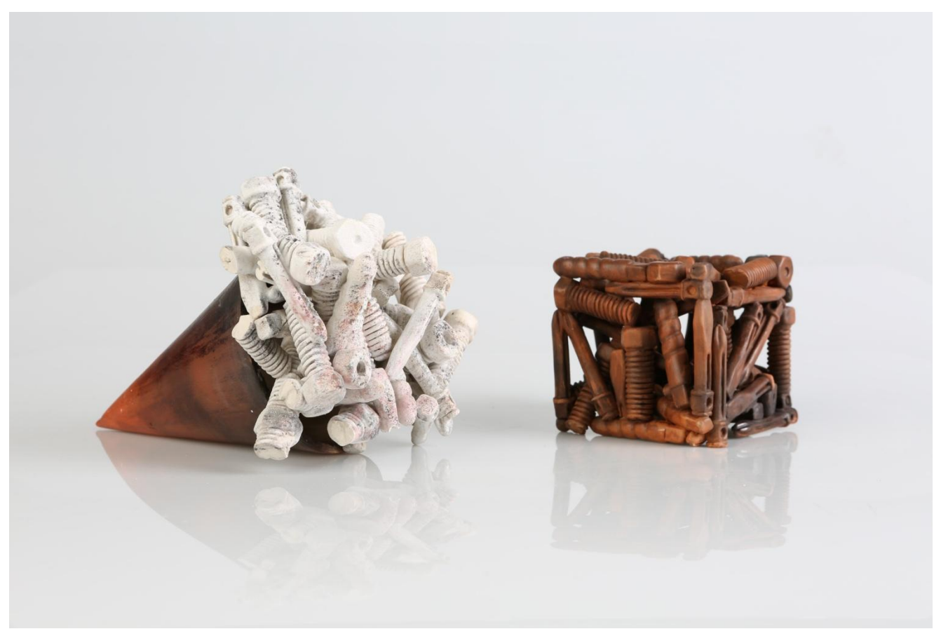
Anti Utopia, 2014, 2 pieces, 10 \times 10 \times 10 cm and 20 \times 10 cm, Slip casting and hand building, terra sigillata