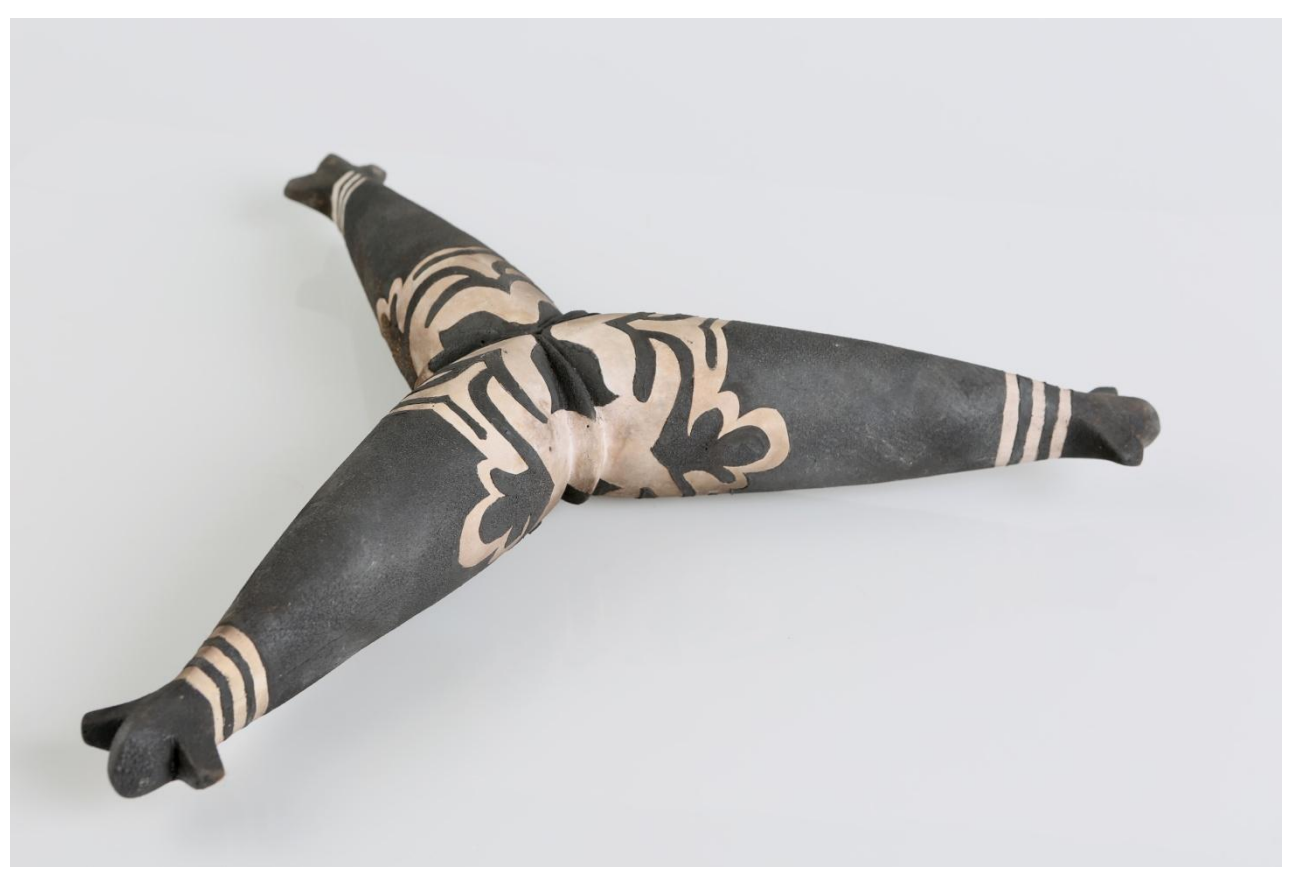
SUMATRA II, 2015, 42 x 42 x 8 cm, Hand built, smoke fired