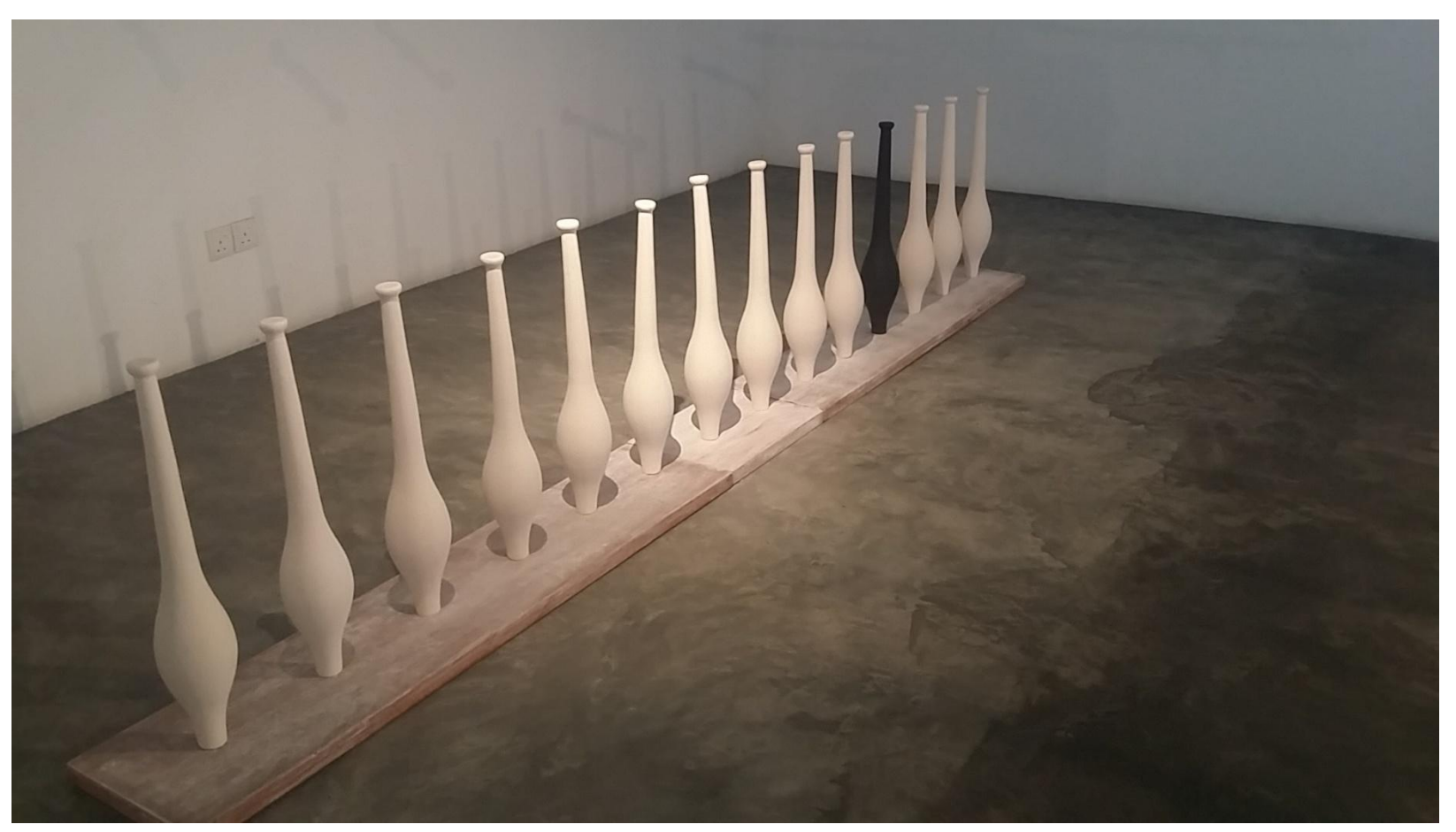
Juggler's Pins, 2014, 350 x 31 x 68.5cm, Local Slip Clay/Fired at 1.000°C, Kiln Casting/Carving Decoration by Hand