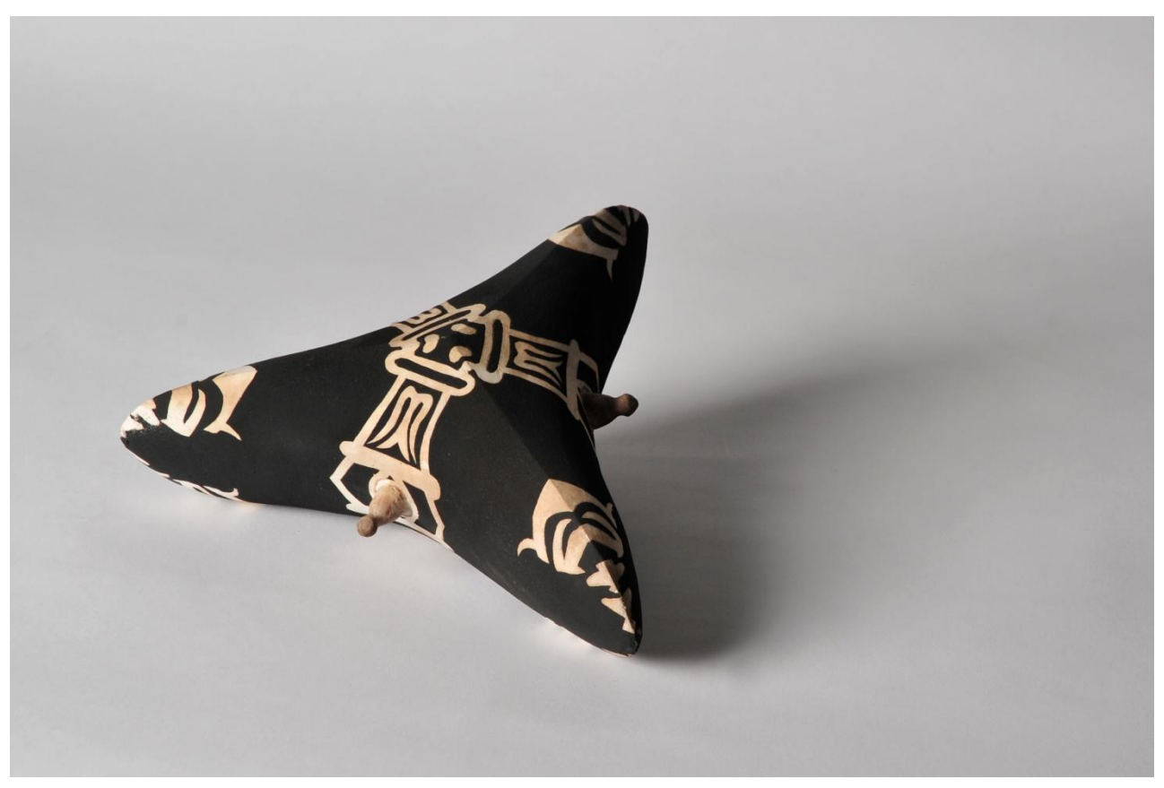
SUMATRA I, 2014, 30 x 30 x 11 cm, Hand built, smoke fired