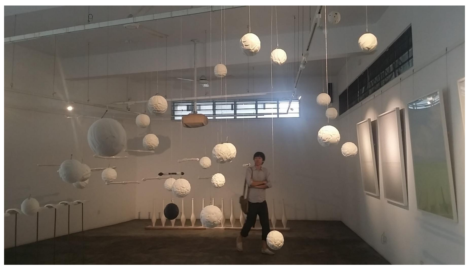
Juggler's Balls, 2013, 300 x 150 cm Installation, Limoges Porcelain/ Fired at 1.280 °C, Mold Casting/Carving Decoration by Hand