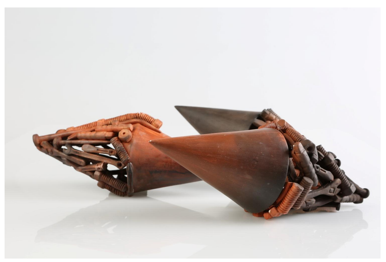
Utopia Trilogy, 2014, 3 pieces, 30 x 10 cm, Slip casting and hand building, terra sigillata