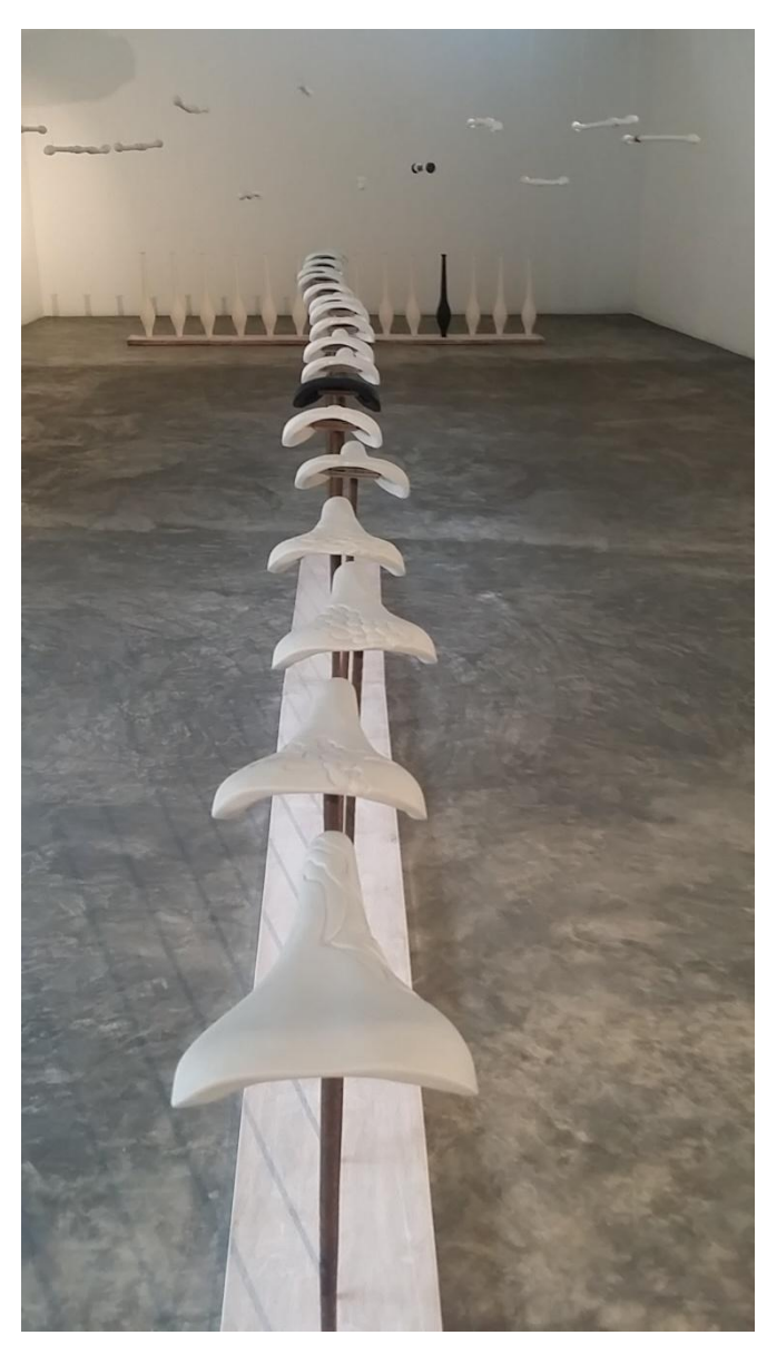
Bicycle Seats, 2013, 450 x 31 x 150 cm Installation, Limoges Porcelain/Fired at 1.280 ^{\circ} C, Mold Casting/Carving Decoration by Hand