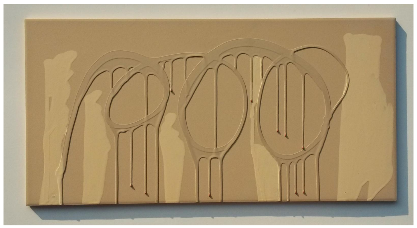
Nature Will Take Its Course 4- Series 1, 2015, 60x30x1 cm, Press Tile, Slip Application, Underglaze.