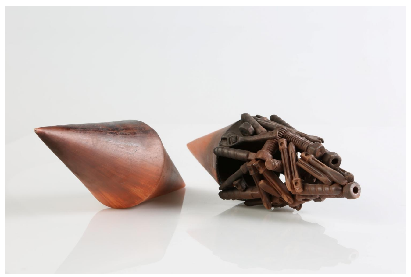
Utopia Tandem, 2014, 2 pieces, 30 x 10 cm, Slip casting and hand building, terra sigillata