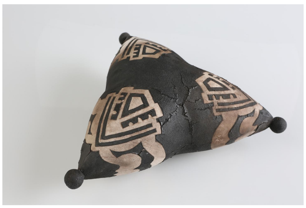
SUMATRA III, 2015, 30 x 30 x 10 cm, Hand built, smoke fired