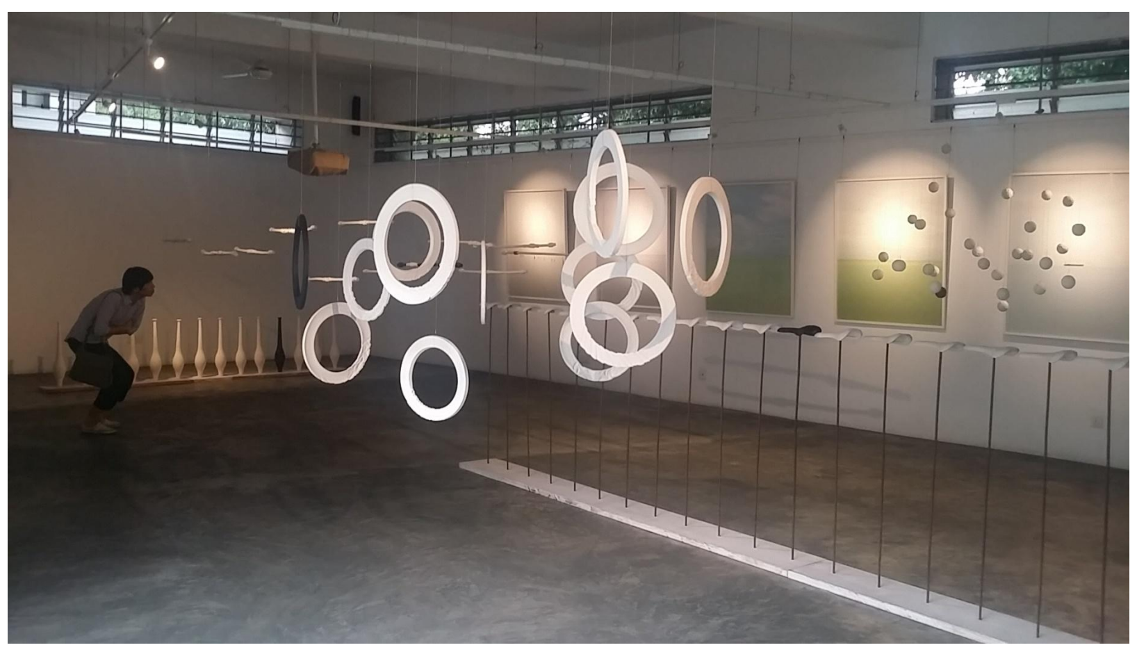
Juggler's Rings, 2013, 300 x 150 cm Installation, Limoges Porcelain/ Fired at 1.280 °C, Mold Casting/Carving Decoration by Hand